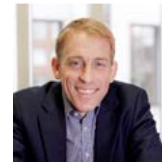
Robin Mortimer Chief Executive Port of London Authority

Building the right safety infrastructure can reduce the pressure on the emergency services and ultimately save lives.