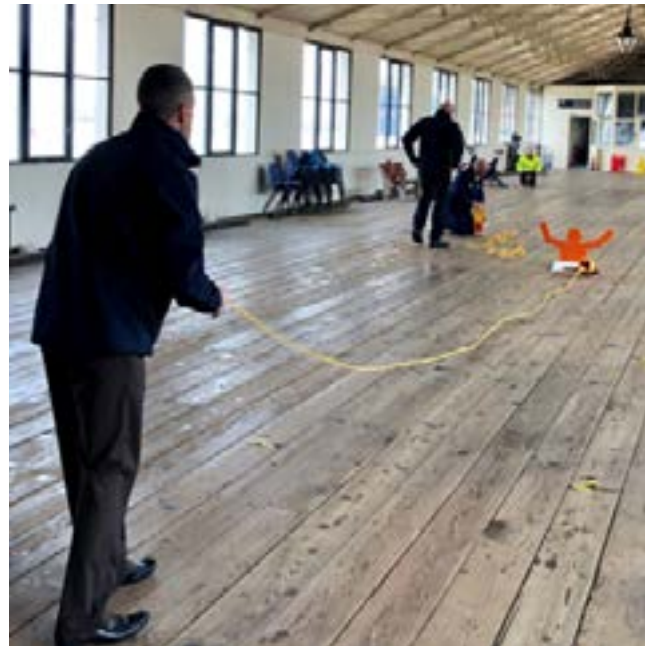
ABOVE: THROW LINE TRAINING PROVIDED TO PLA STAFF

Recommendation 7: It is recommended that all risk assessments give specific consideration to water safety education and appropriate levels of training for all construction workers on riparian sites and that water safety posters are displayed on site.