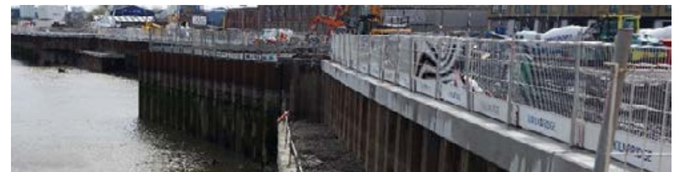
LEAMOUTH PENINSULA

It is also possible to provide temporary edge protection to protect construction workers during construction: