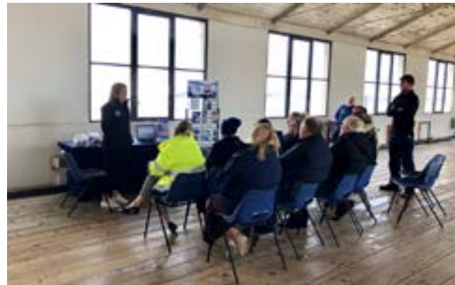
ABOVE: WATER SAFETY EDUCATION PROVIDED TO PLA STAFF AS PART OF HEALTH, SAFETY AND WELLBEING WEEK

However, there is still much more that can be done. When new developments or infrastructure are being built, workers on the sites may be unaware of the risks of working near or over water. Additionally, the residents who move into the new development may not have lived near to water before and be unaware of the hazards associated with the tidal River Thames. There is the potential to integrate water safety education programmes and information into new and existing developments by the river, to work with the emergency services to deliver education programmes for construction workers and residents, and to provide people with practical skills, such as throw line training.