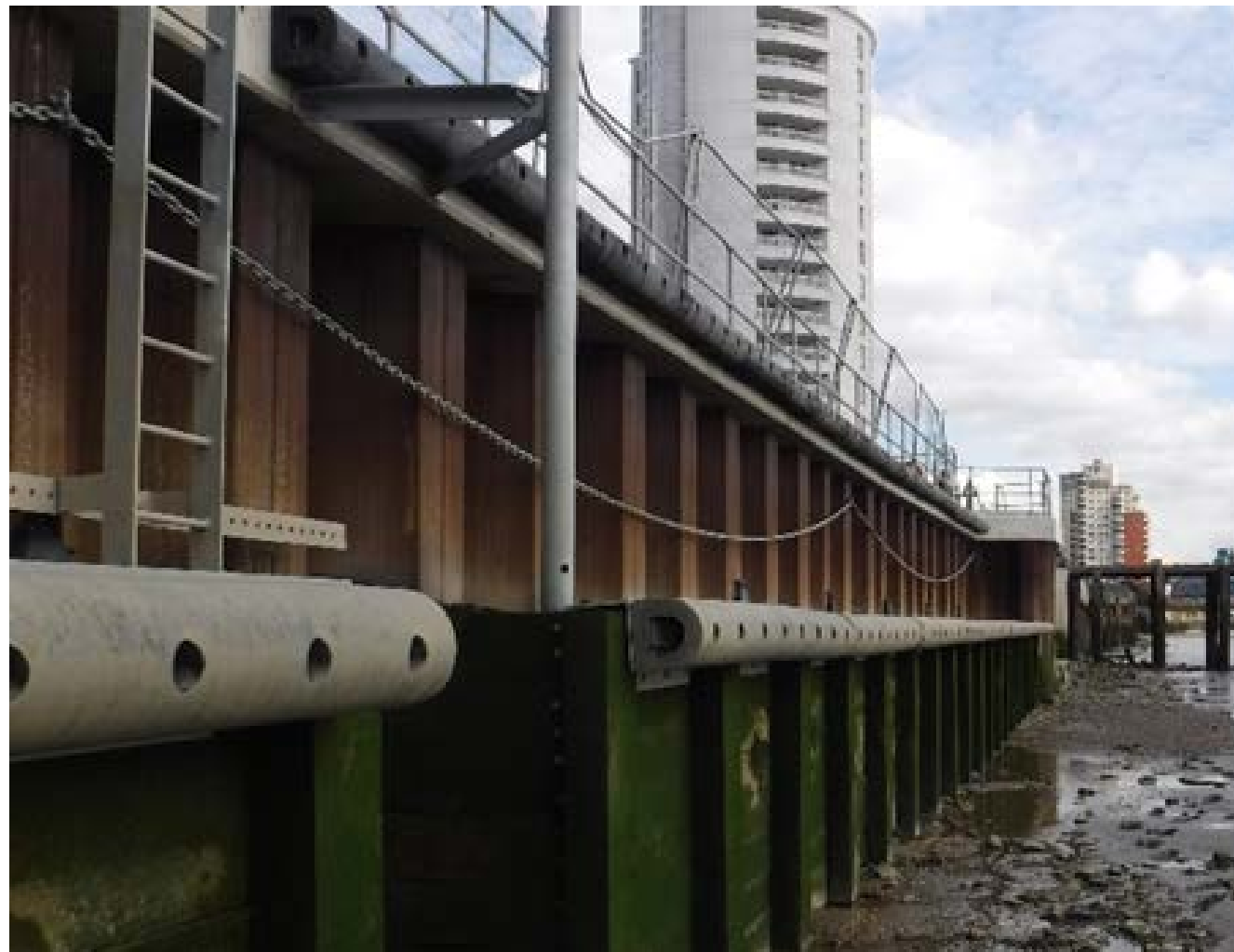
RECENT LONDON WATERSIDE DEVELOPMENT – PHOTOGRAPH COURTESY OF HOP CONSULTING.