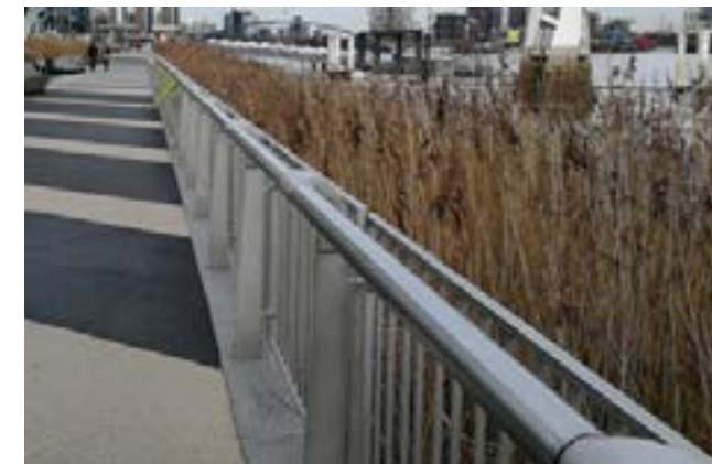
GREENWICH PENINSULA – PHOTO COURTESY OF BURO HAPPOLD