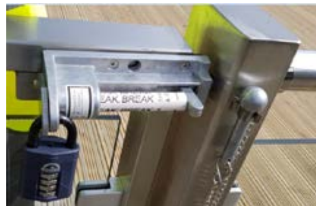
BATTERSEA POWER STATION JETTY - PHOTOGRAPHS COURTESY OF BECKETT RANKINE