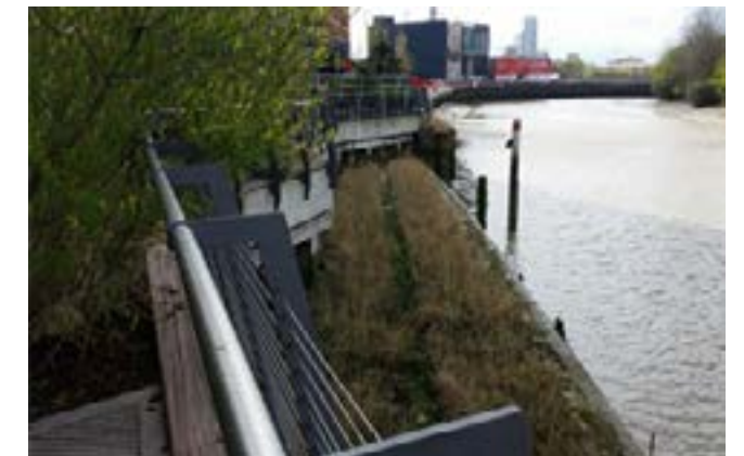
LEAMOUTH PENINSULA – PHOTO COURTESY OF HOP CONSULTING