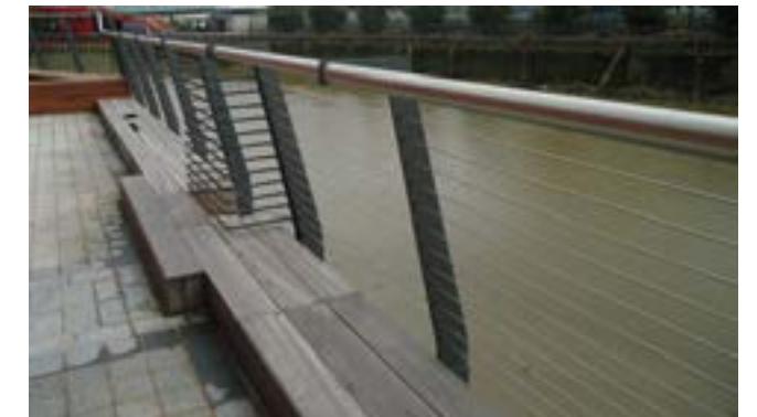
LEAMOUTH PENINSULA – PHOTO COURTESY OF BURO HAPPOLD