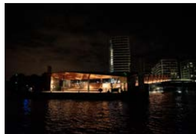
ROYAL WHARF PIER

Recommendation 6: Riparian and bridge owners must review existing lighting schemes and update them, where required. New developments and bridges must design in and provide suitable lighting before it is open to the public or residents.