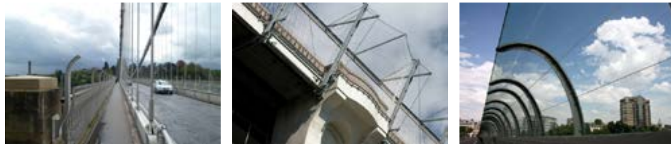
CLIFTON SUSPENSION BRIDGE, BRISTOL

New bridges should be designed from the outset with appropriate edge protection.