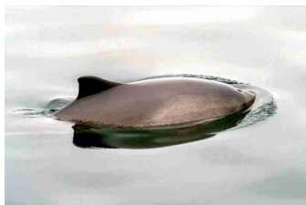
Harbour porpoise

Marine mammals are known to visit the Thames estuary but until now sightings have not been formally recorded. Our survey is ongoing and addresses this information gap. Data collected will determine patterns in species distribution, behaviour and habitat use. Findings will also be fed into national databases. Our survey is operating in the tidal Thames area, from Teddington down to Shoeburyness and Sheerness in the outer estuary.