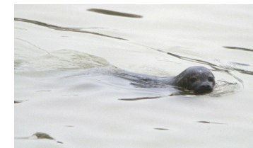
Common seal at Tower Bridge 17/2/05

Marine mammals are known to visit the Thames estuary but until now sightings have not been formally recorded. Our survey is ongoing and addresses this information gap. Data collected will determine patterns in species distribution, behaviour and habitat use. Findings will also be fed into national databases. Our survey is operating in the tidal Thames area, from Teddington down to Shoeburyness and Sheerness in the outer estuary.