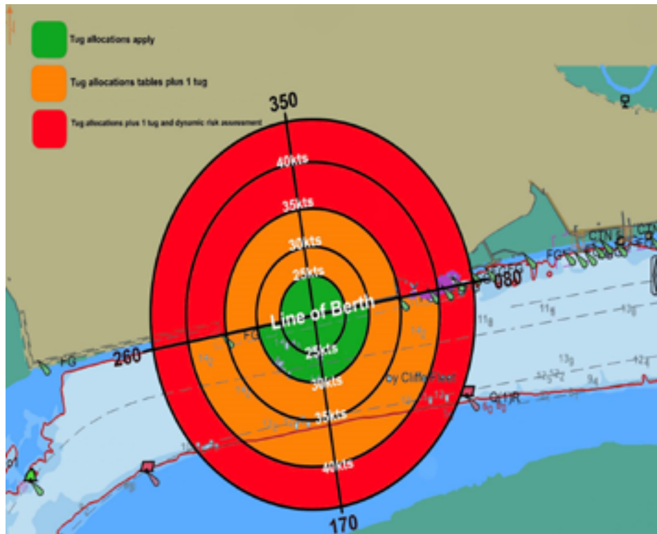
TABLE 4 - AUGMENTATION OF TOWAGE REQUIREMENT DUE TO WIND CONDITIONS